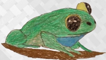
Drawing by Eliana