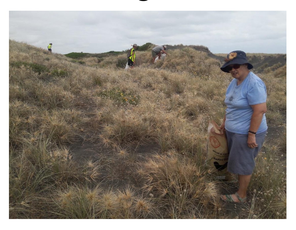
Above - Spinifex collection Right - stripping Pingao seeds