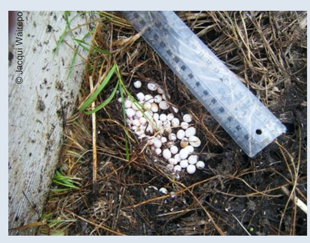
Eggs of plague skinks are small, white and oval shaped

Plague skinks are also a threat to other native plants and animals because they are omnivores – they eat crickets, snails, worms, beetles, flowers, small fruits spiders and even other small lizards. Because of this they could significantly affect our native ecosystems.