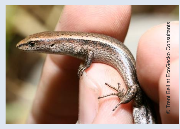
The small, invasive plague skink