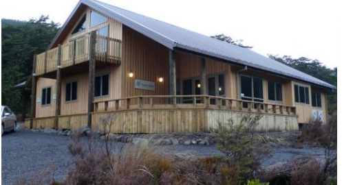
F&B Lodge – Mt Ruapehu