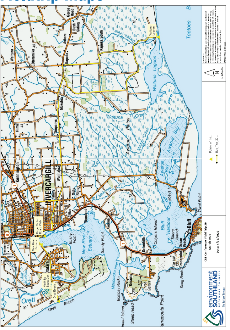
Friday 20 Mar