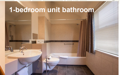
1-bedroom unit bathroom