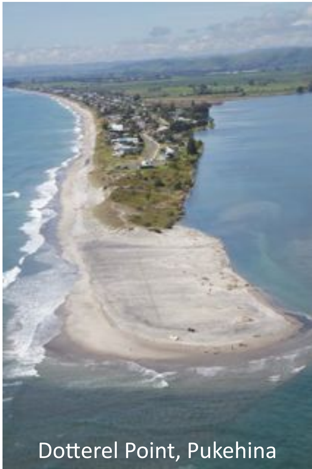
Dotterel Point, Pukehina