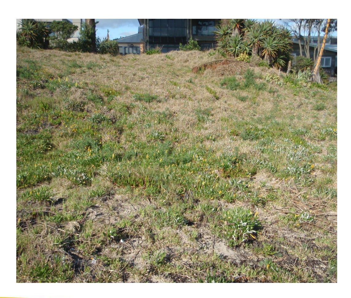
Working together to care for our coast – Kia ngatahi te tiaki takutai