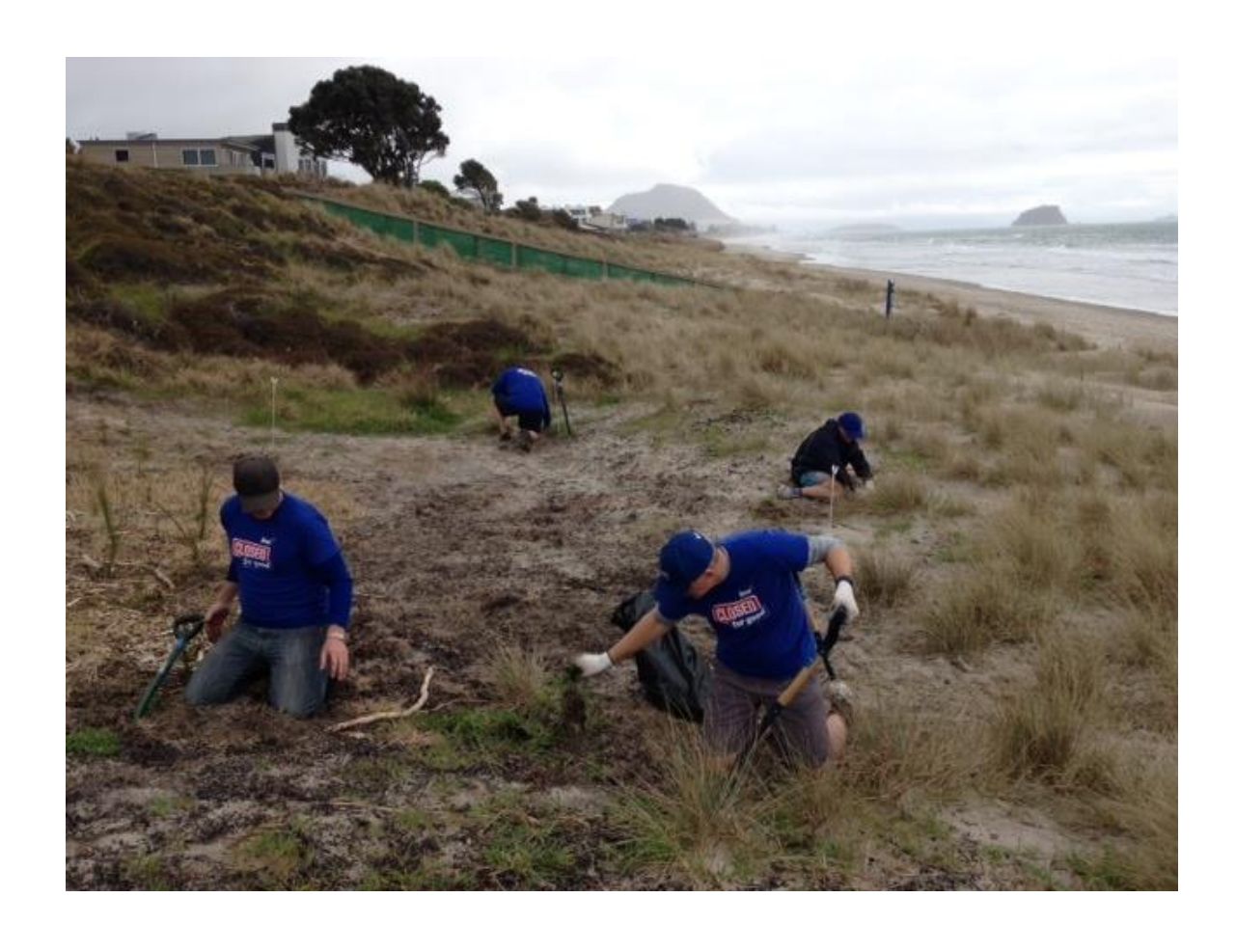
BNZ Closed for Good planting site at Omanu Beach