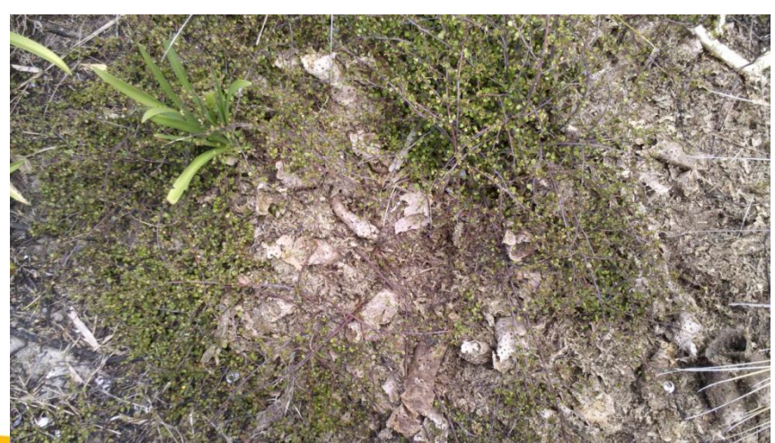
Working together to care for our coast – Kia ngatahi te tiaki takutai