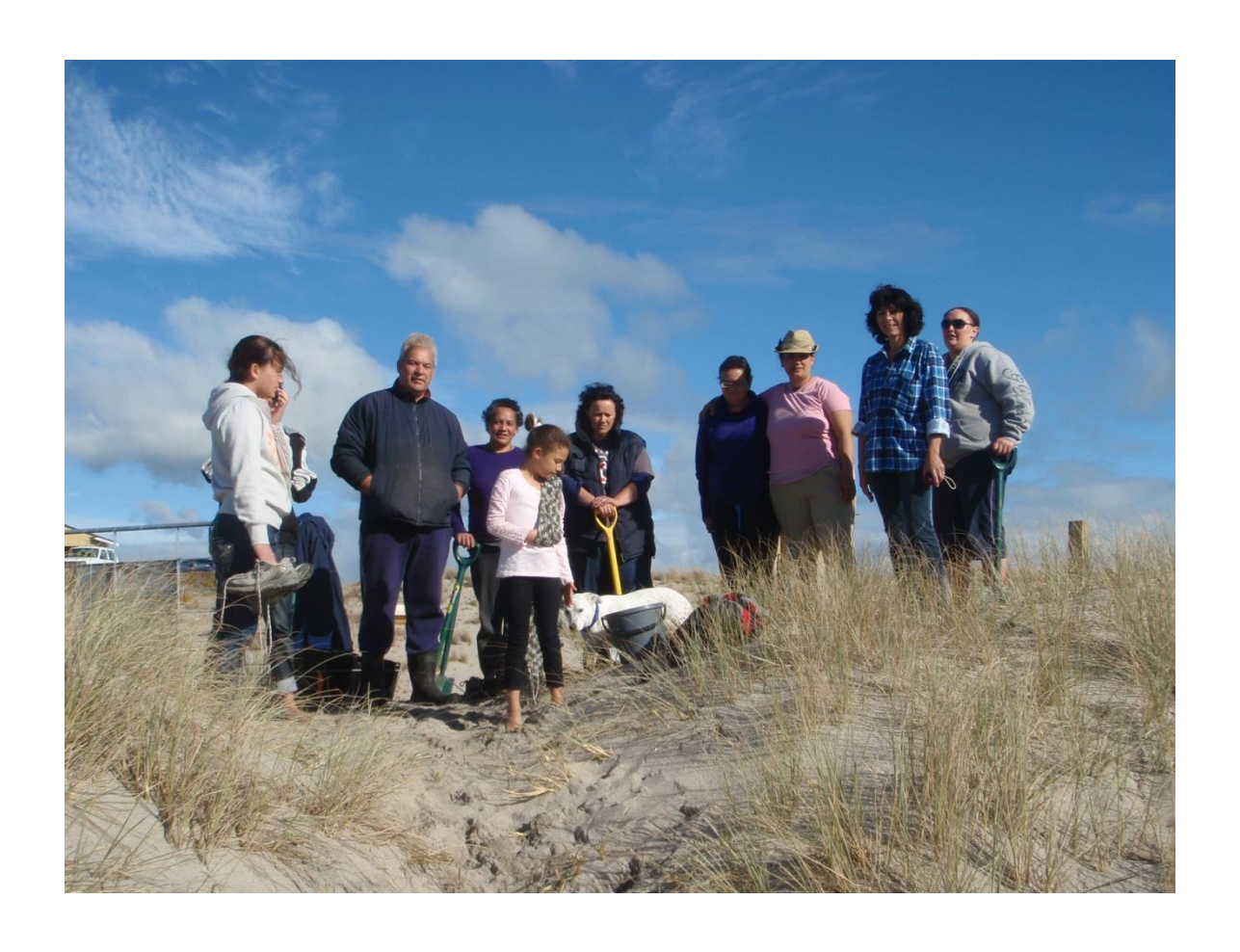
Iwi groups planting dunes on their land.