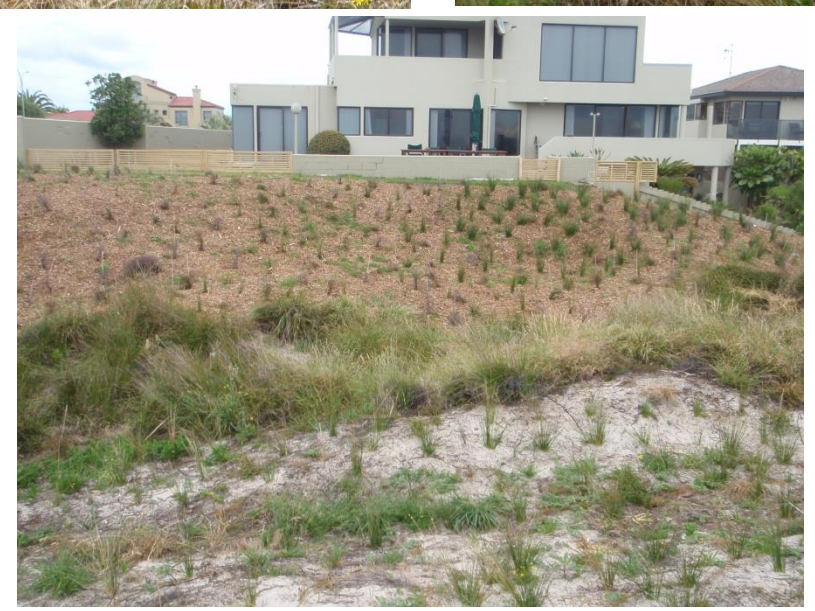
Working together to care for our coast - Kia ngatahi te tiaki takutai