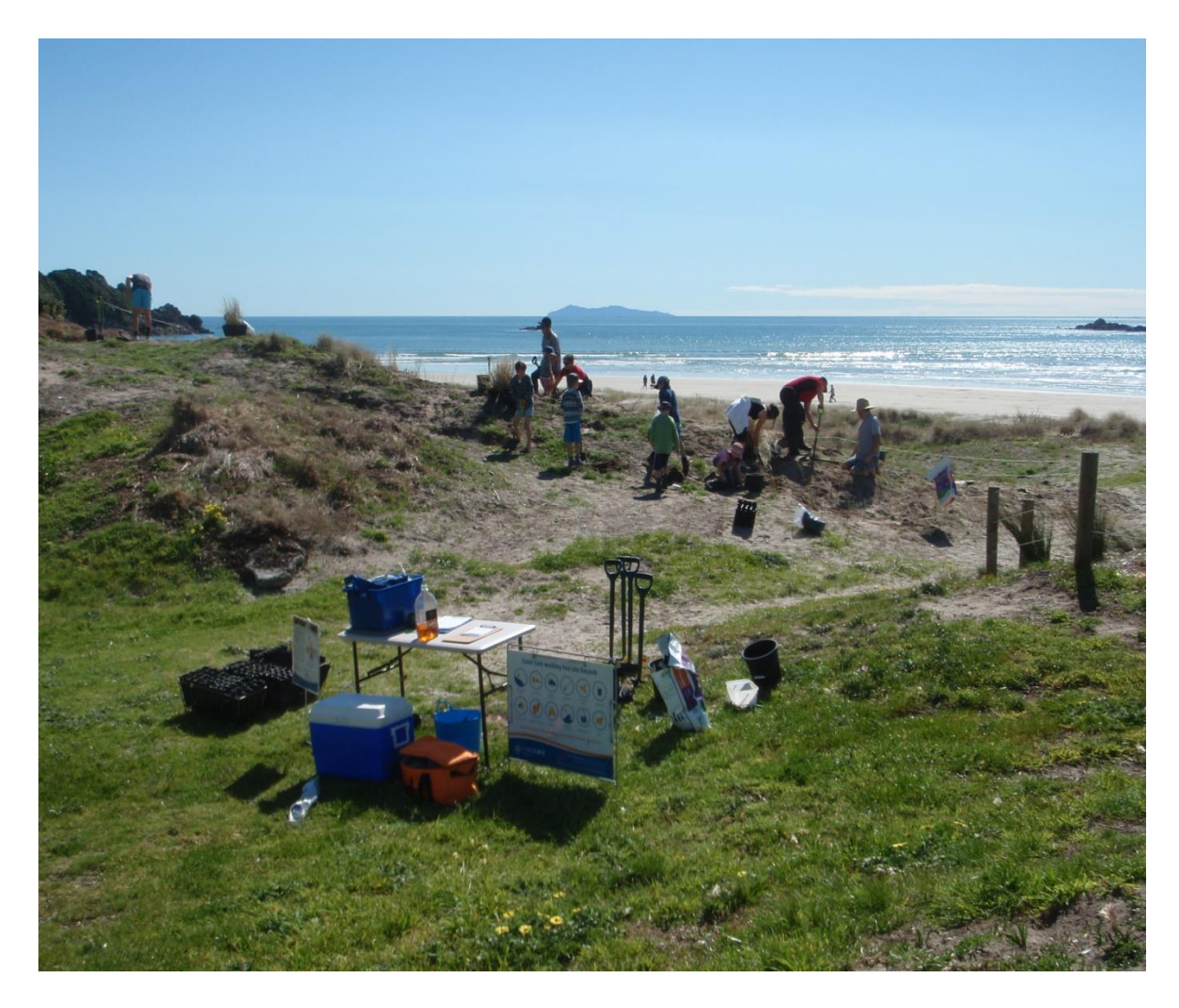
They volunteer to help plant for an hour or two or what ever time they can spare.