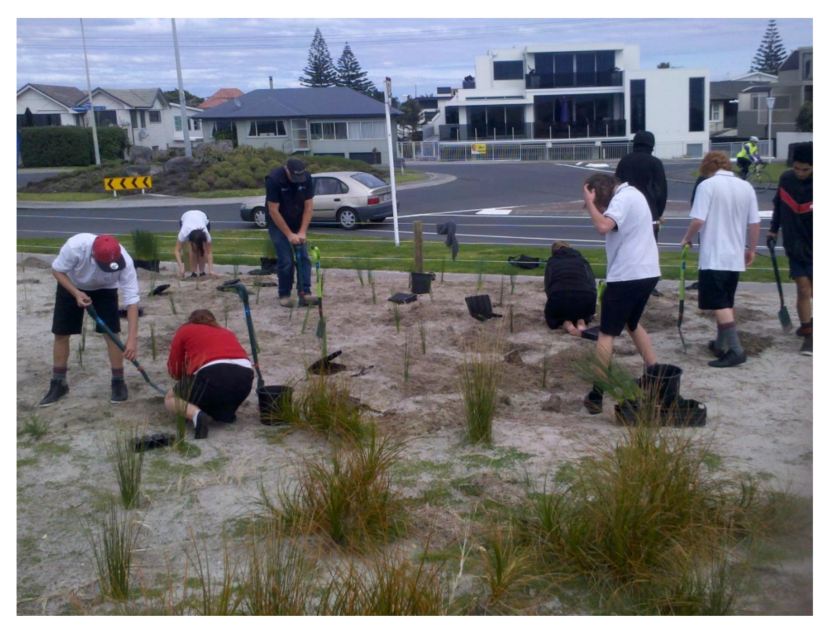
Mount College Gateway students volunteer to plant for an hour every week for about 10 to 12 weeks.