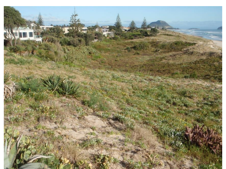
Working together to care for our coast - Kia ngatahi te tiaki takutai