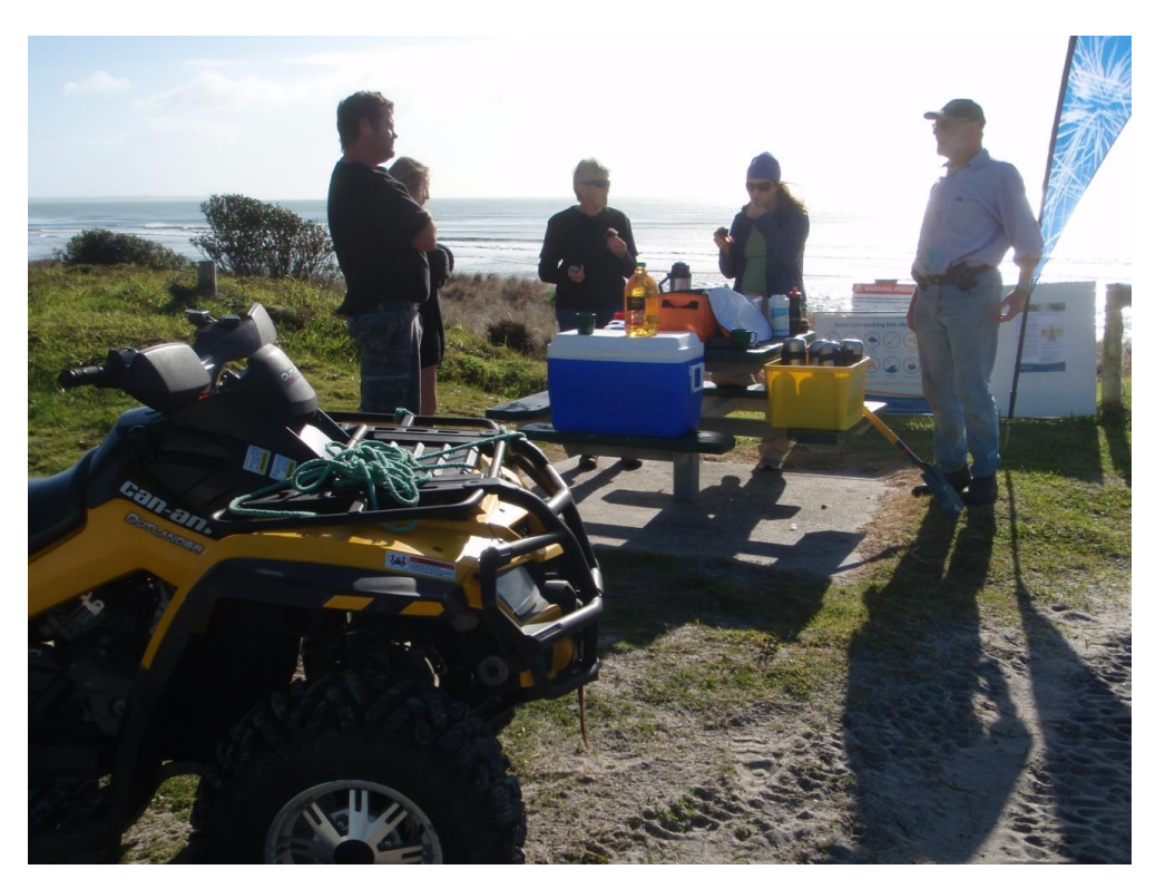
Other volunteers form groups like the Maketu Ongatoro Wetland Society, who work at Maketu & Pukehina Beach.