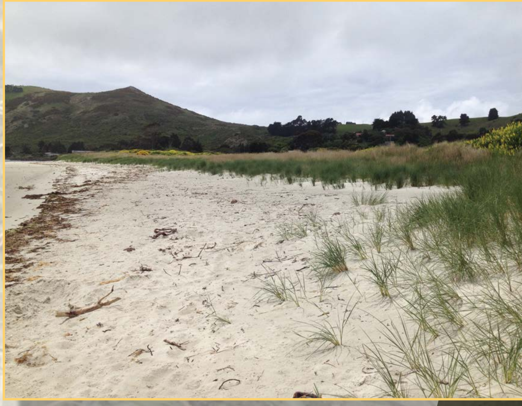
Harington Beach, Otago Peninsula

theory and practical application of dune restoration in local contexts.