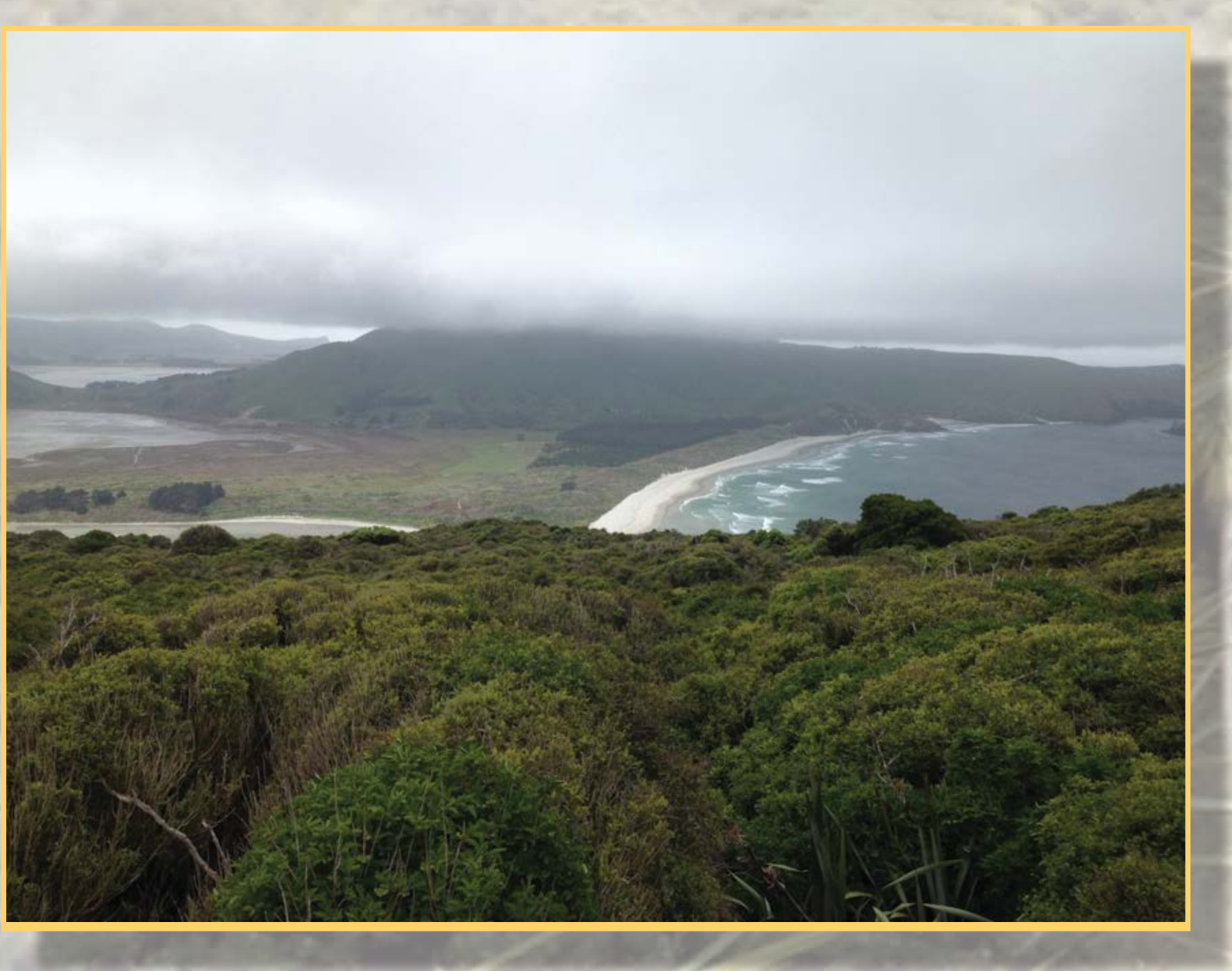
Aromoana, Otago Peninsula