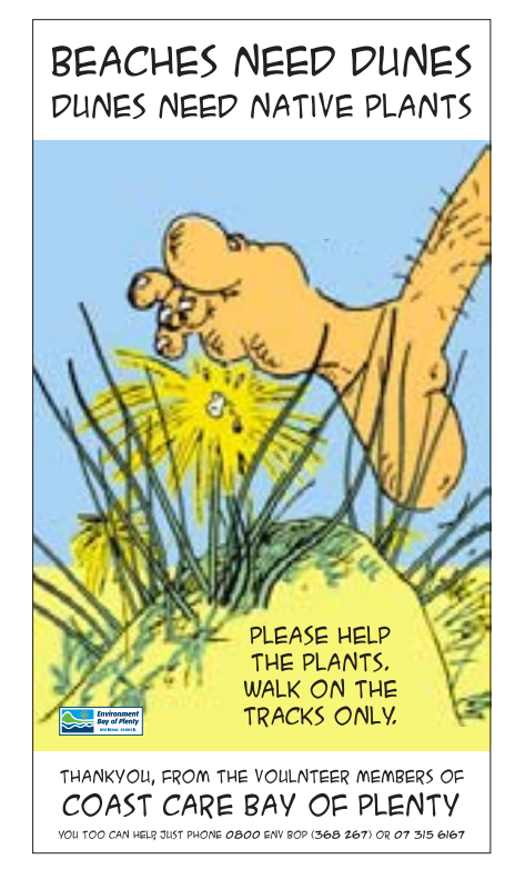
Figure 7: Simple eye-catching signage used by Coastcare Bay of Plenty

If vehicle use occurs on local beaches, management action will often be required to minimise problems as a small percentage of users (most commonly trail bikes) will generally choose to "hoon" on the dunes. This can be an extremely difficult problem to manage, especially at remote sites, and can result in serious dune damage at exposed sites with strong winds. In the Bay of Plenty work is progressing to establish a region-wide cooperative control programme using a combination of by-laws and permits to minimise this increasingly serious threat to dune stability. All statutory land managers (Regional, City and District Councils, DOC etc) are party to this control initiative to ensure consistency. Environment Waikato and other regional and district councils are also involved in discussions with a view to a coordinated approach along west coast beaches, where very serious issues are starting to develop.